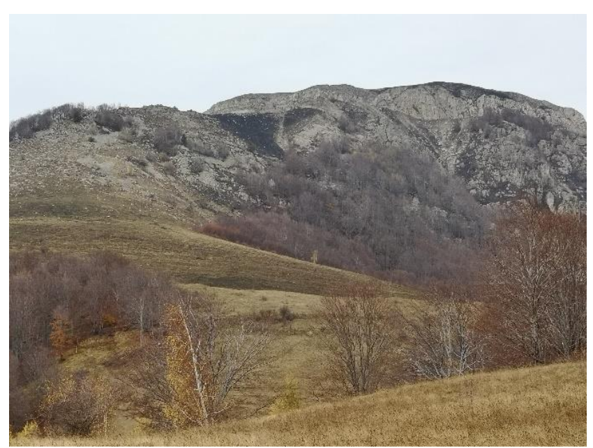
Picture 2 – Domogled Valea Cernei, fire area/buffer.