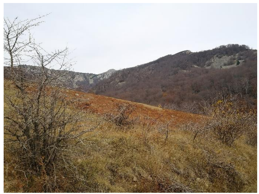
Picture 1 – Domogled Valea Cernei, fire area area/buffer zone.