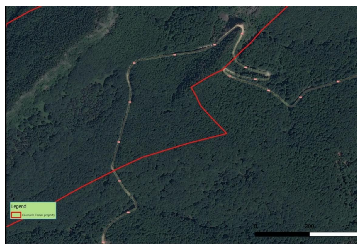
Map 2 - National Road 66A crossing the Ciucevele Cernei component.

The mission is of the view that such modification would have a negative impact on the property's integrity, potentially affecting its OUV, keeping in mind the small size of this component and thus its weak resilience to any disturbance and/or degradation.